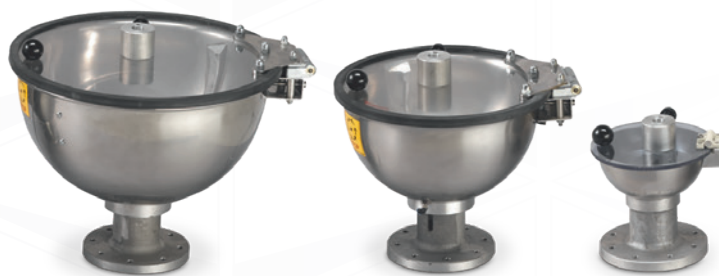
Seed bowl small – medium – large