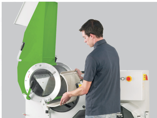
Changing the threshing basket