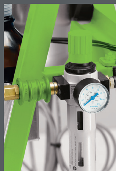
Option: Air-operated unit

We reserve the right to make technical alterations.