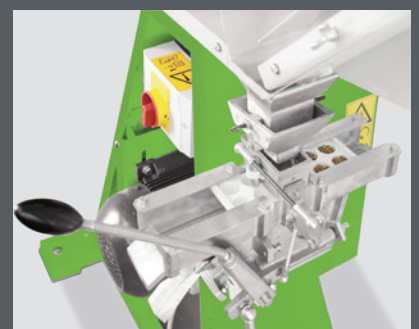
Option: Magazine hopper