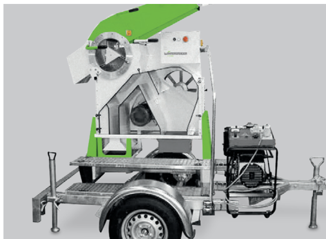
Single axle trailer with light