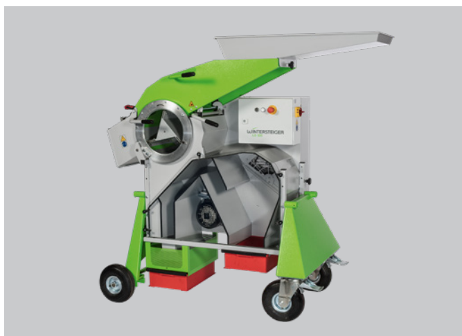
Chassis with 4 wheels