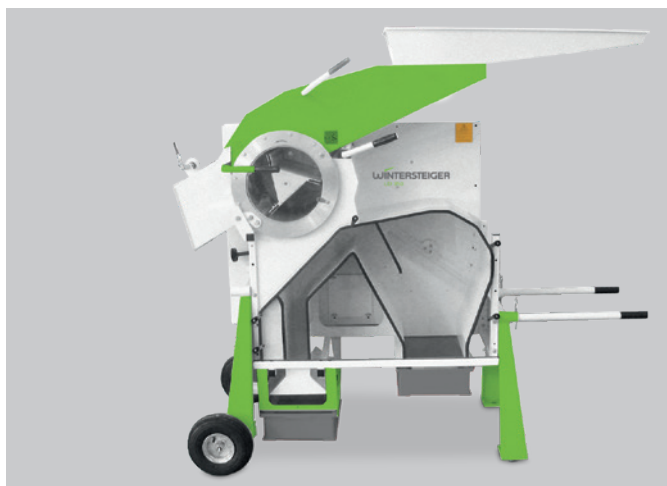
Chassis with 2 wheels

The following mobile versions of the WINTERSTEIGER LD 350 are available: