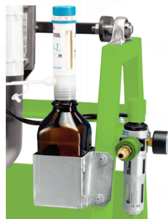
Dispensette with brown glass bottle