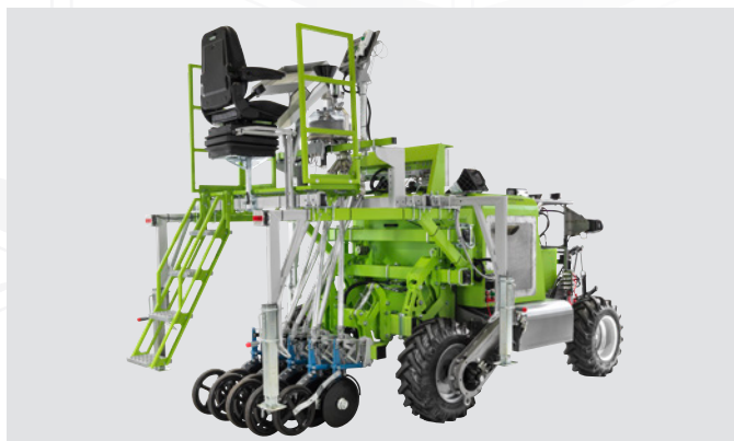
Tool Carrier with Plot / Row Motion