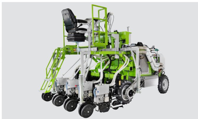
Tool Carrier with Dynamic Disc Plus